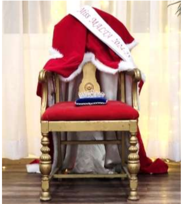
Miss Malta throne with cape, sash, and crown