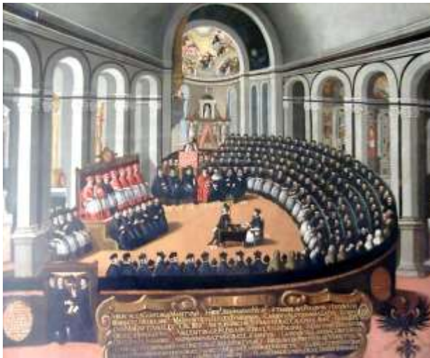
Council of Trent

Alarmed by the spread of Protestantism, Pope Paul III (1534–1549) convened the Council of Trent (1545–1563) to reform the Church and to repel the spread of Protestantism.