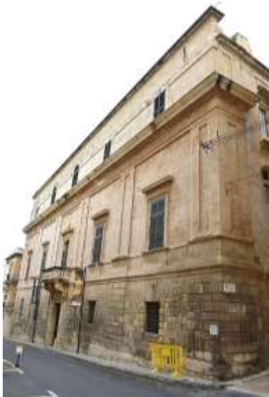
Inquisitor's Court (Palace), Birgu