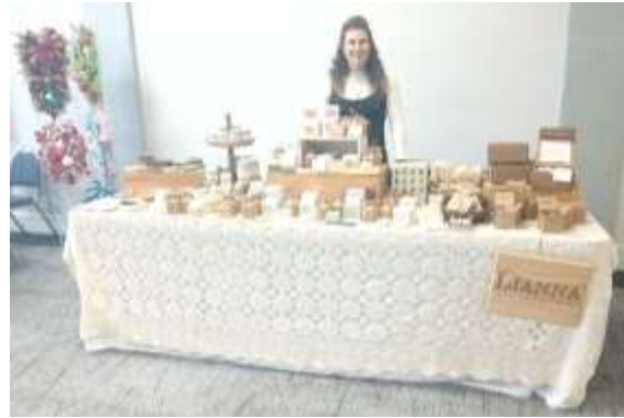
Soap and Body Butter