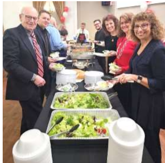
A buffet dinner