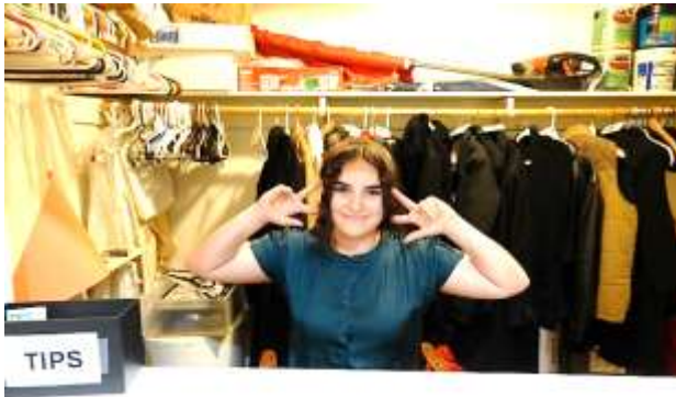
The cloakroom attendant