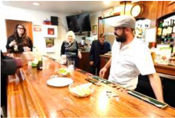
The bar scene