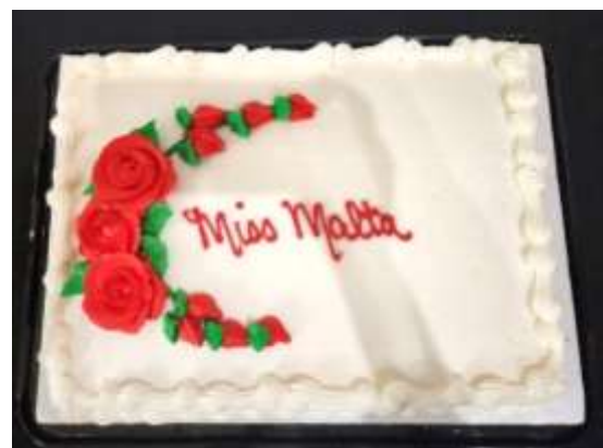
One of the desserts