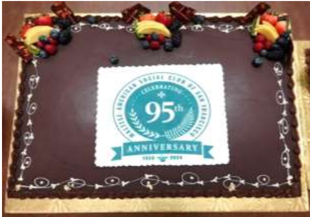
One of the cakes