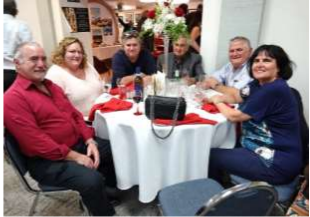
Some of the guests at their tables