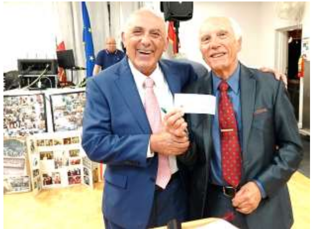
A proud winner