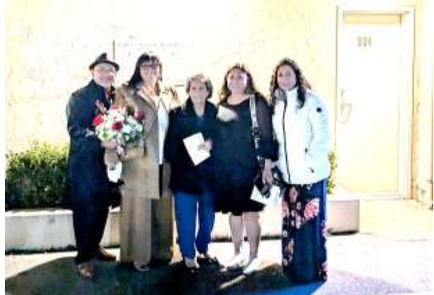
At the end of a memorable evening