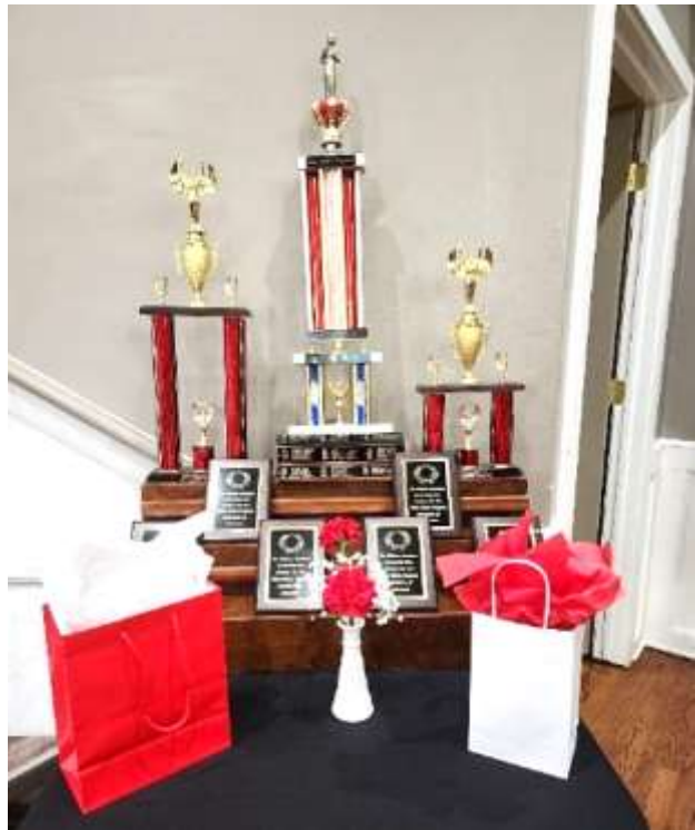
Miss Malta trophies and prizes