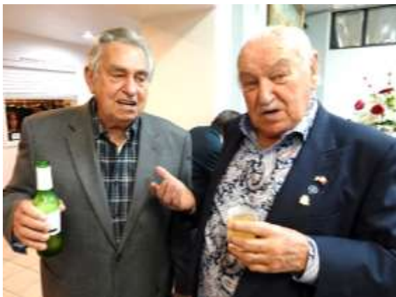
A premeal drink