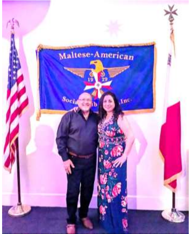
After the lights are turned down